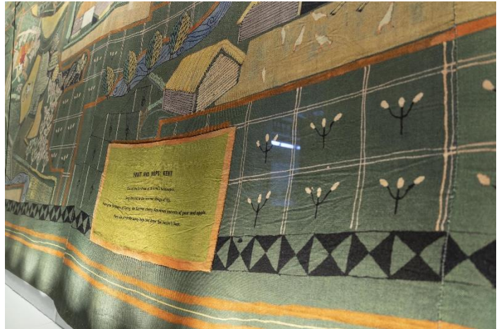
Detail of a Festival of Britain wall-hanging (MERL 63/18/-19)