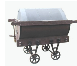
Cheese Vat Forces for Change