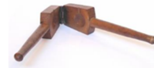
Lemon Squeezer Collecting Rural England