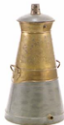
Milk Churn Town and Country