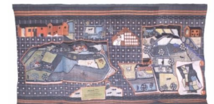
Wall Hanging - Cheshire Our Country Lives