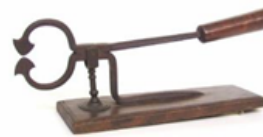
Sugar Cutters Making Rural England