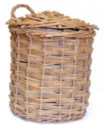
Cheese Basket Forces for Change