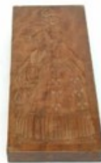
Gingerbread Mould Making Rural England