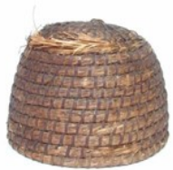
Bee Hive Skep