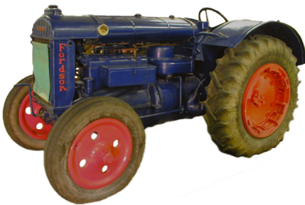
Fordson Model N 1937 (80/44/5)

The Fordson tractor was first made by Ford in 1917 in the USA, and thousands were brought to England during and at the end of the first world war. This tractor was registered in 1937 or 1938.