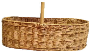
Seed Lip 1965-1966 (66/267)

A seed lip would have been hung from the sowers left and he would have cast with his right hand. On the way back across the field, he would have swapped over. This willow and cane seed lip was made for the museum in 1965-1966.