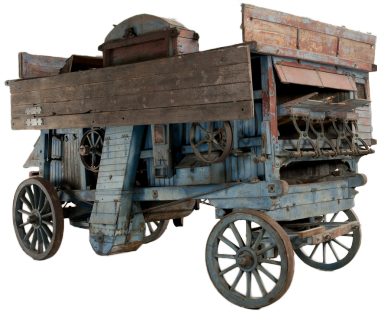
Threshing Machine 1900 (52/42)

This threshing machine was built in Worcestershire in 1900. It was used for completely preparing a cereal crop; from threshing to bagging up the grain.