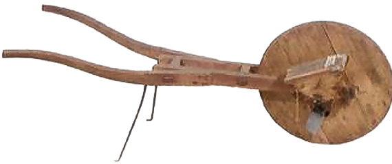
Seed Drill 1953 (61/48)

This wooden seed drill was used for sowing seeds on farms in West Sussex. It was used up until 1953. No information is known by the museum about when or where it was made.