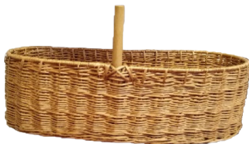
Seed Lip 1965-1966 (66/267)

A seed lip would have been hung from the sowers left and he would have cast with his right hand. On the way back across the field, he would have swapped over. This willow and cane seed lip was made for the museum in 1965-1966.