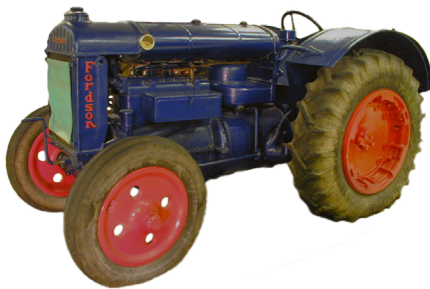
Fordson Model N 1937 (80/44/5)

The Fordson tractor was first made by Ford in 1917 in the USA, and thousands were brought to England during and at the end of the first world war. This tractor was registered in 1937 or 1938.